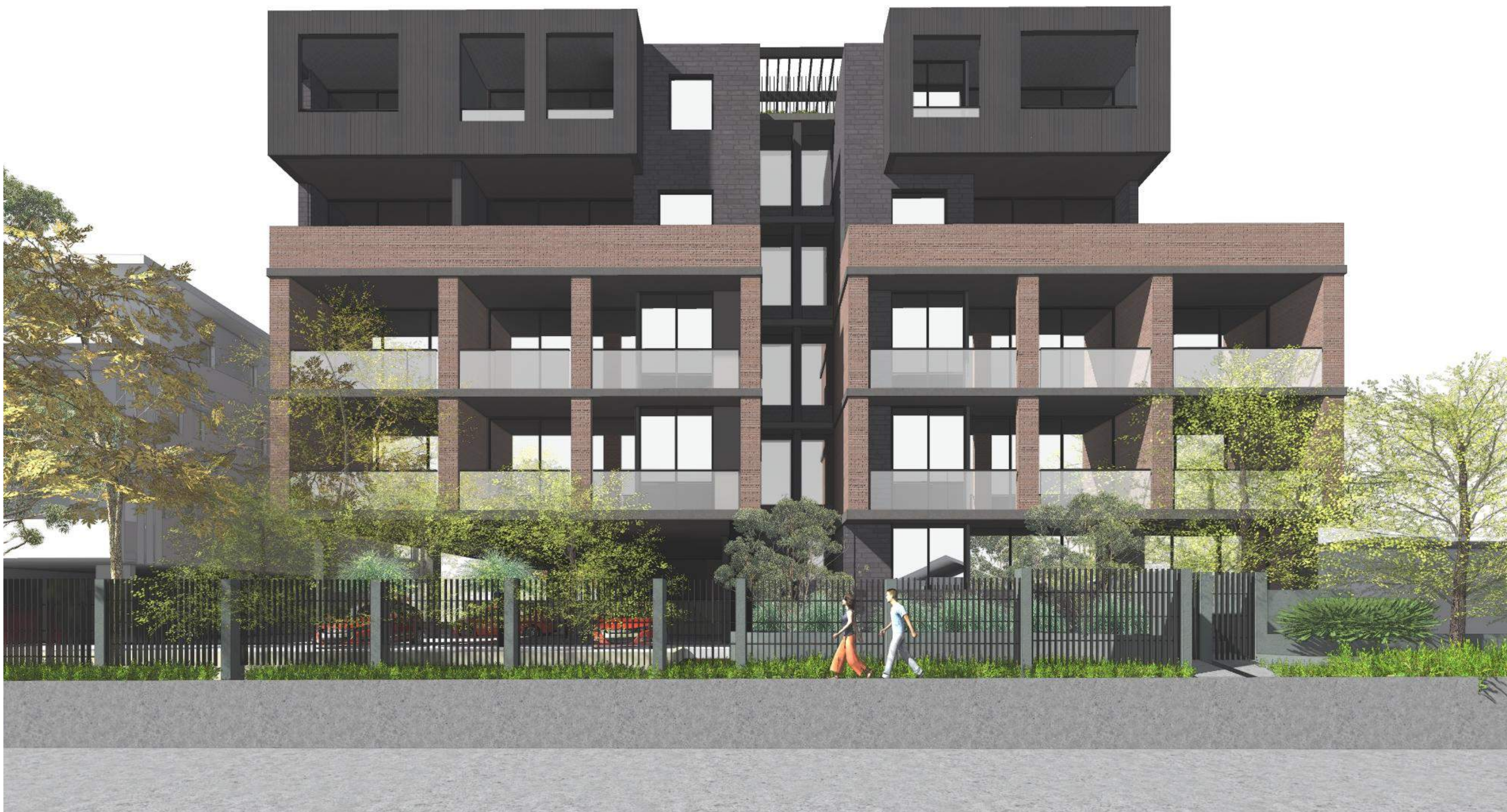
Perspective View from Edgeworth Place